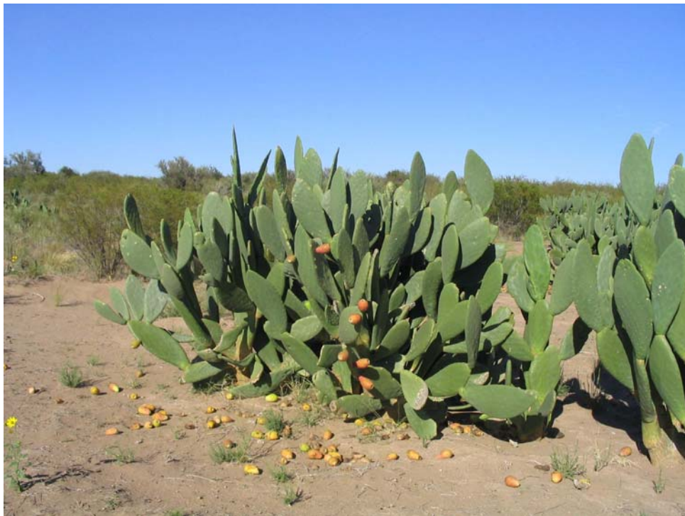
Figure 8. View one of overall plant morphology of Opuntia ficus-indica L. f. inermis (Web.) Le Houér.