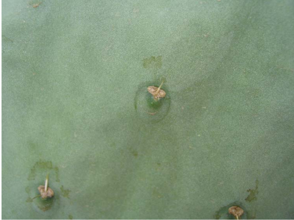
Figure 7. Close up of the areoles of Opuntia ficus-indica L. f. inermis (Web.) Le Houér.