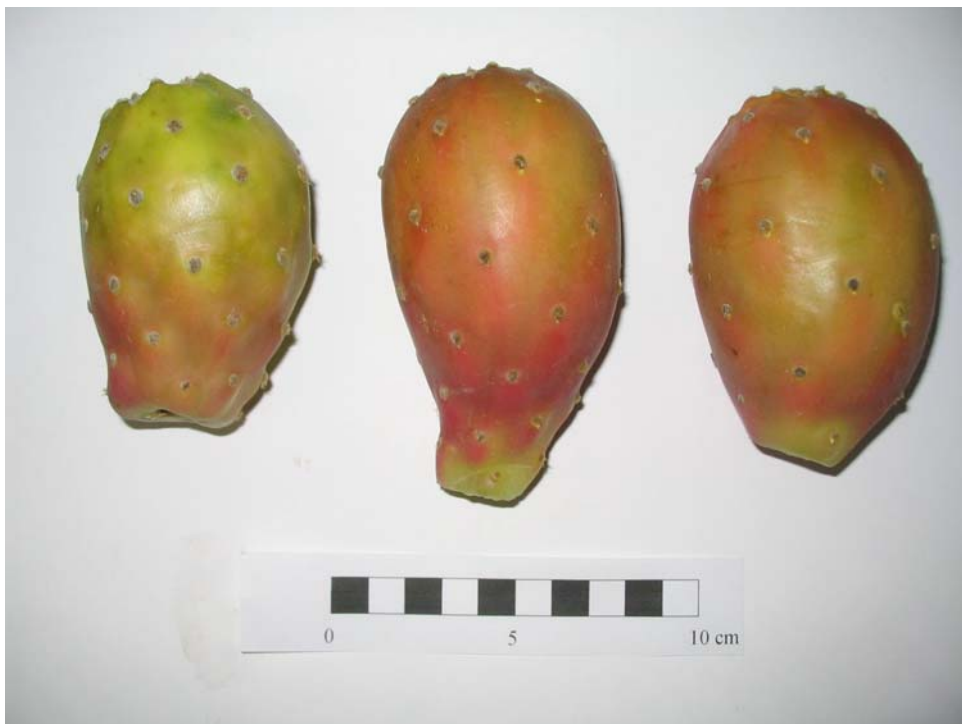
Figure 4. Variation in size and external fruit color of Opuntia ficus-indica L. f. inermis (Web.) Le Houér.