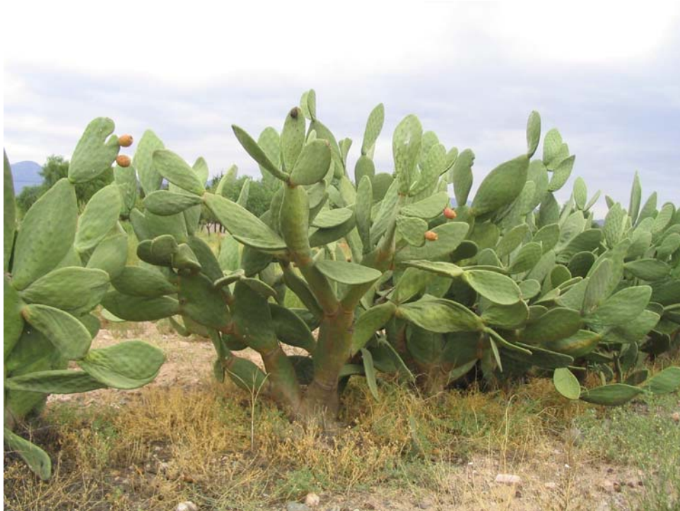
Figure 9. View two of overall plant morphology of Opuntia ficus-indica L. f. inermis (Web.) Le Houér.