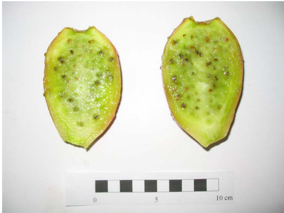
Figure 5. Internal view of fruit of Opuntia ficus-indica L. f. inermis (Web.) Le Houér.