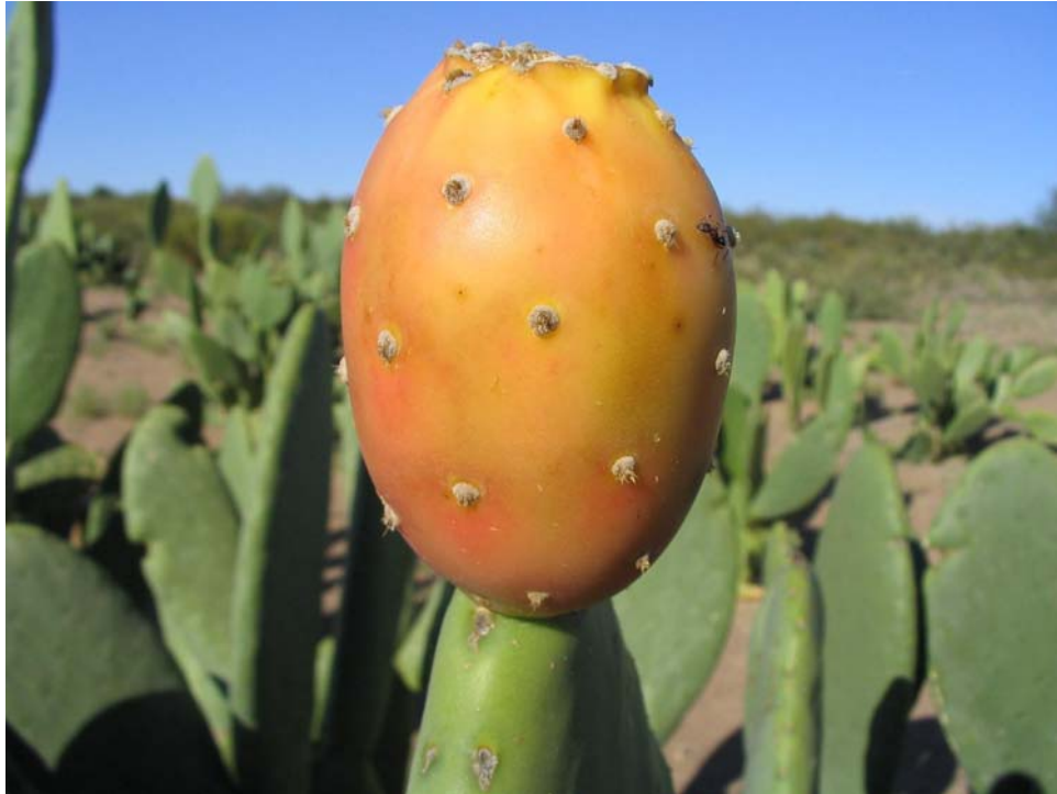
Figure 3. View of fruit of Opuntia ficus-indica L. f. inermis (Web.) Le Houér. on the plant in Mendoza, Argentina.