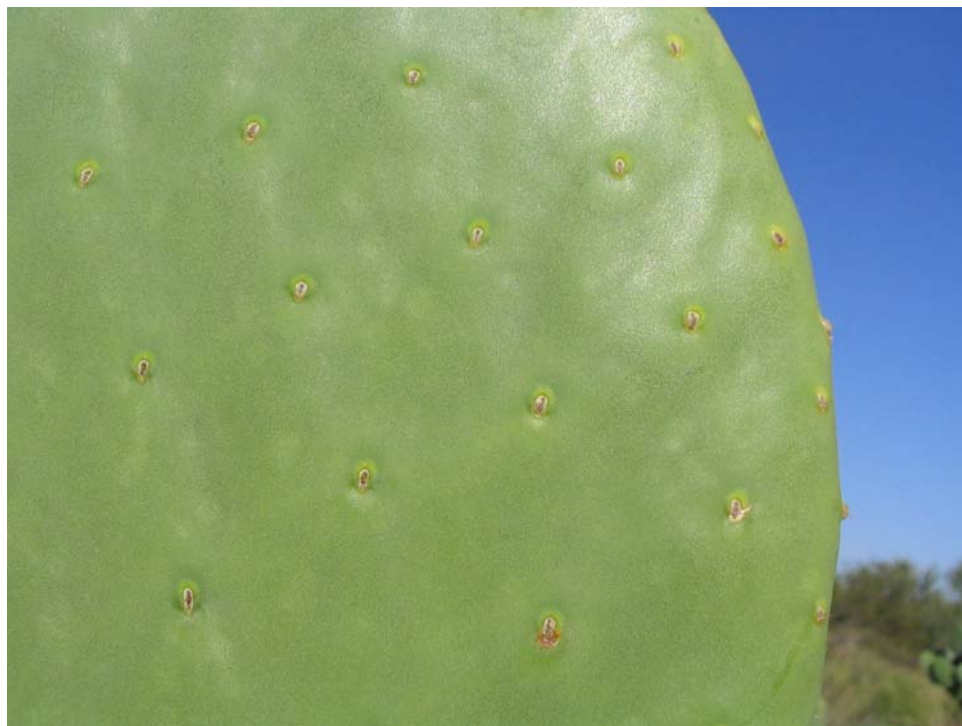
Figure 6. Overview of cladode of Opuntia ficus-indica L. f. inermis (Web.) Le Houér.