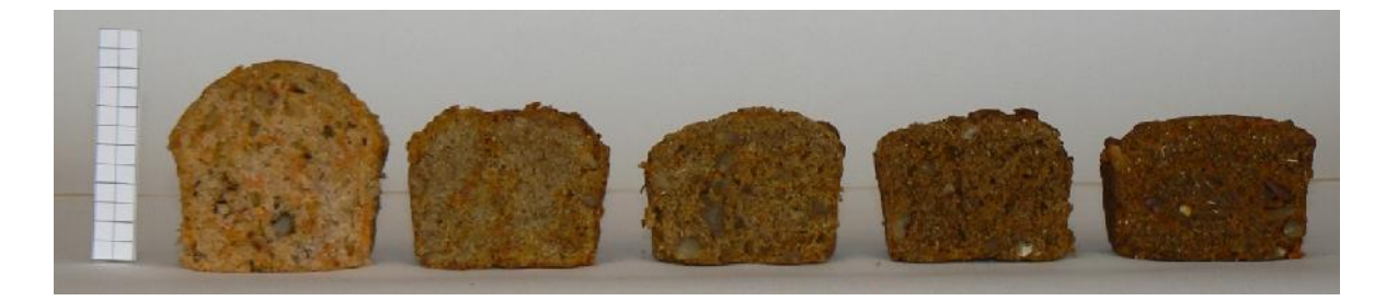
Figure 1b. Sliced cakes indicating cactus flour levels from 0 (left), 25, 50, 75 to 100% (right).

Figure 1a. Whole carrot cakes with increasing cactus flour levels from 0 (left), 25, 50, 75 to 100% (right).