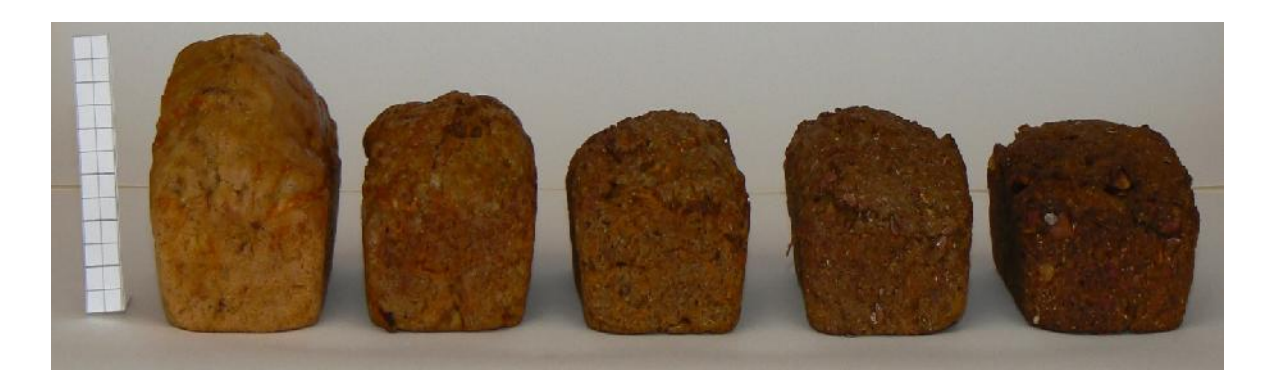
Figure 1a. Whole carrot cakes with increasing cactus flour levels from 0 (left), 25, 50, 75 to 100% (right).

The appearance (visible color and volume) and texture of the carrot cake was influenced by the incorporation of cactus flour (Figures 1a and 1b). This was particularly visible on the crust, with an increase in darkness, as well as cracks appearing on the surface. The volume of the cakes also decreased and became more compact with an increase in concentration of the cactus flour. No peaks and tunnels formed with increased concentration. Surface breakdown in baked wheat products with increased cactus pear flour inclusion was reported by Ayadi et al. (2009). The fortification with cactus flour increased water holding capacity (WHC) and increased the tenacity, while decreasing the elasticity, therefore causing an increase in hardness and stickiness. These authors also reported increased browning, because of the Maillard reaction, as well as caramelization. Samia El-Safy (2013) reported increased resistance to extension and decreased extensibility in sponge cake.