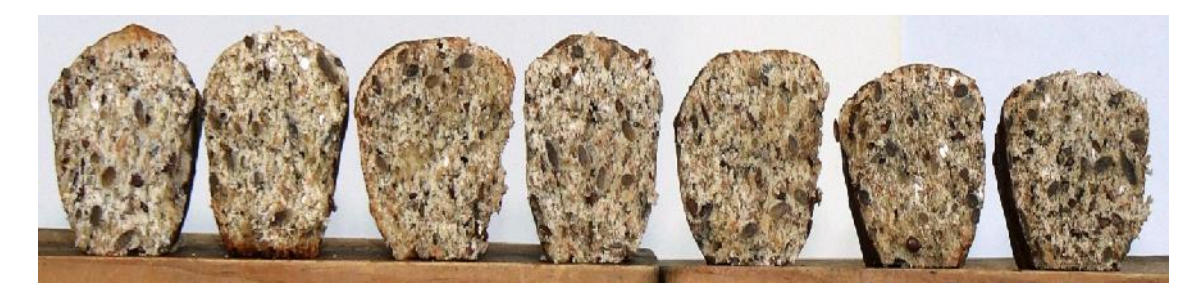
Figure 2: The seven cladode flour substitution seed bread samples, from the control, 2, 4, 6, 8, 10 and 17% inclusion level.

Increasing contents of cactus flour caused the volume and texture of the seed bread to change noticeable (Figure 2). The volume decreased and the texture became more solid and firm. Ayadi et al. (2009) also reported an increase in density in wheat baked products with cactus flour inclusions.