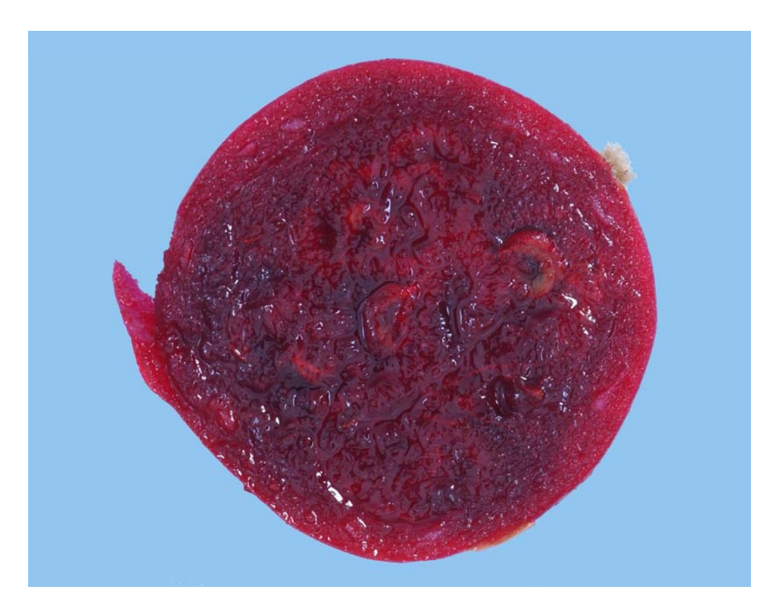
Figure 4. The cross section of an Opuntia dillenii fruit reveals purple pigmentation throughout the juicy pulp.