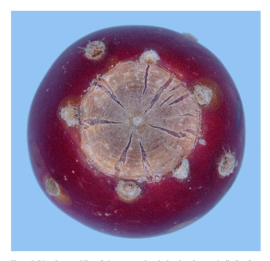
Figure 3. Ripe Opuntia dillenii fruits are not only spineless but also practically free from glochids. These examples measure 3.9 to 4.6 cm in length and 2.6 to 3.5 cm in diameter.