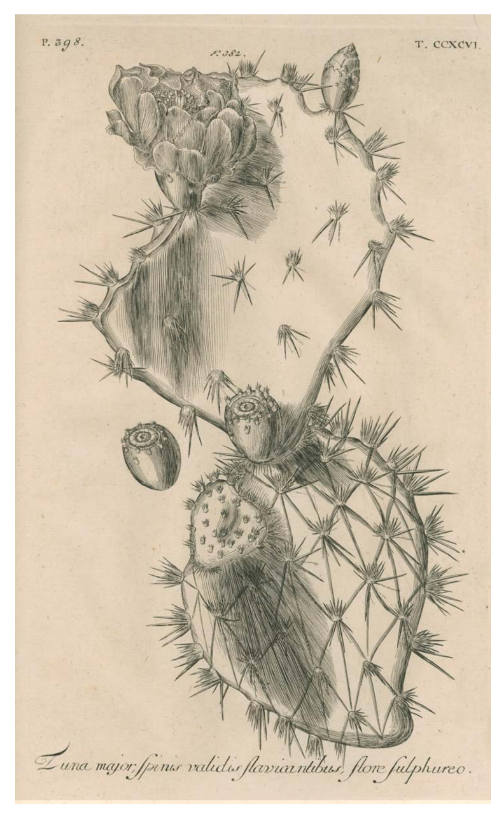
Figure 1. The first description of Opuntia dillenii in Hortus Elthamensis, 1732.