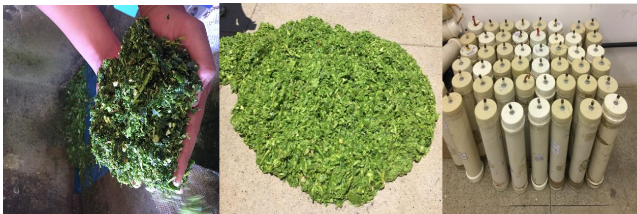
Figure 1. Arboreal cotton (A); cactus pear (B); experimental silo (C)

Arboreal cotton (leaves and stems) was harvested 24 months after planting, in its second cut, being considered a diameter of 7 mm for cutting the stem of the plants. For cactus pear, the material was cut from the first order cladodes one year after planting. After harvesting, the material was crushed, homogenized manually, and deposited in experimental silos. During this process, a 500-g aliquot was taken from the original sample with non-ensiled material.