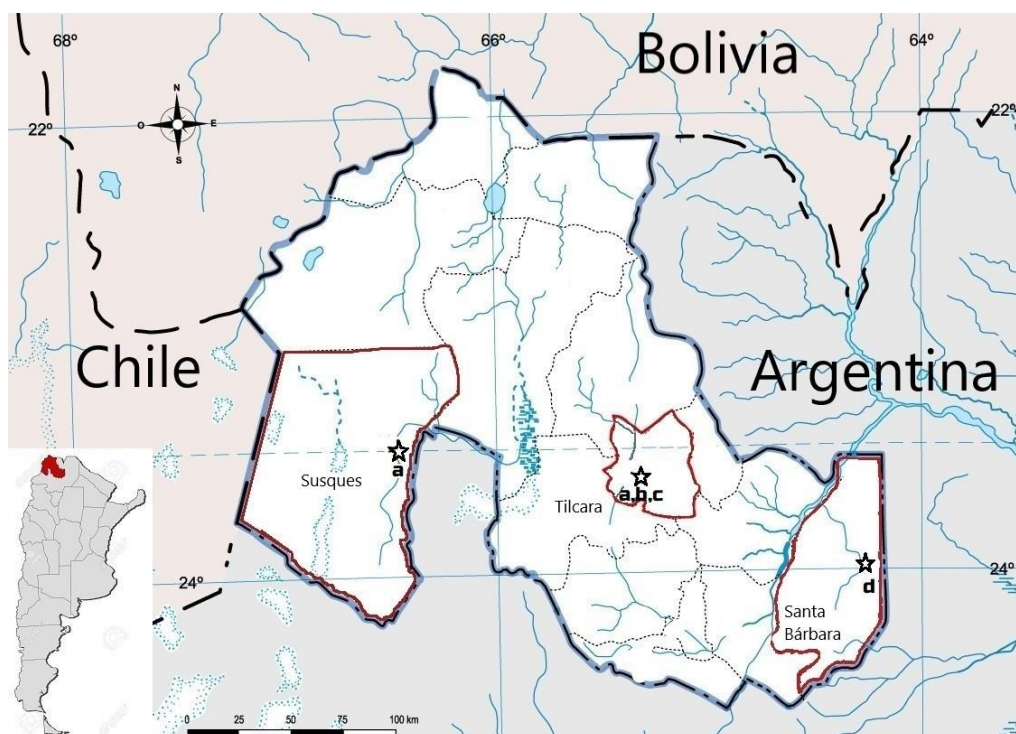
Figure 2. Sampling sites (stars) at Tilcara, Susques and Santa Bárbara departments where the studied species were collected: (a) T. atacamensis , (b) T. schickendantzii , (c) T. tarijensis , and (d) T. terschekii .

decided to reduce the number of individuals sampled as much as possible. Specimen removal for this experiment was approved by the Environment Ministry of Jujuy Province (Res. N° 106/2015-DPB, N° 044/2016-S-B and N°091/2017-S-B). Samples were transported refrigerated to the laboratory where spines were removed. Fresh material was used to establish pH and then totally dehydrated (using a lyophilizer AdVantage Pro Freeze Dryer de SP Scientifics) and ground to dust, the dry material was preserved without moisture or sun exposure until use.