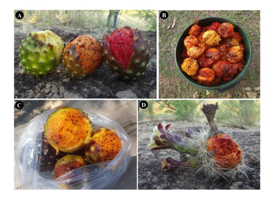
Figure 3 . Different phenotypes and presentations of the Stenocereus montanus fruits for sale in the study areas: (A) fruits of different colors; (B) fruit pulp harvested without the shell for the elaboration of processed products in San José del Llano; (C) fruits in bags offered in the communities of Choix; (D) fruit with atypical flower production.

In both locations, pitaya fruits show pigmentation ranging from white, yellow, orange, and red (Figure 3). However, they are collected and sold indiscriminately. In general, the surveyed harvesters from both localities perceive a different flavor between fruits of different colors, with red being the most preferred; however, a significant percentage in San José del Llano prefers them indistinctly. Most harvesters in both communities use the same daily harvesting routes, which allow them to avoid competition conflicts with neighbors.