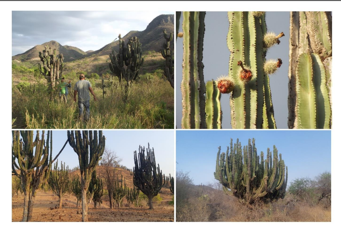
Figure 2. Specimens and representative populations of Stenocereus montanus in the study areas.

Table 2 . Comparison of harvest attributes of Stenocereus montanus between the community of San José del Llano and communities of Choix.