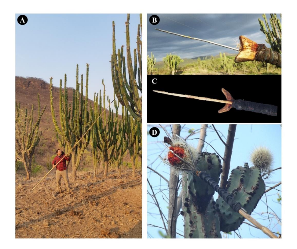
Figure 4 . Tools used to collect Stenocereus montanus fruits in the communities studied: (A) complete pitayero ; (B) pitayero with wooden tip in Choix; (C) pitayero with a metal tip in San José del Llano; (D) pitayero with a metal basket in San José del Llano.

productive populations are in more dispersed hills and farther away from the communities, which imply a greater effort to move and collect, so the work is mainly assigned to men; besides other reasons, such as social security, were also argued.